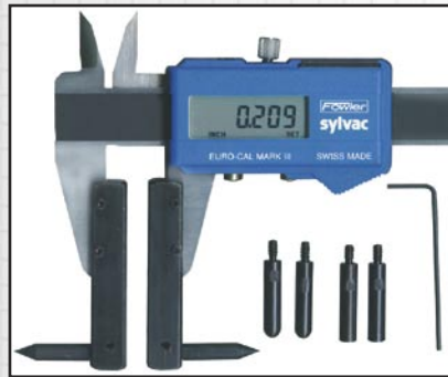
▲ Caliper accessories will fit most standard 4—8" calipers and light duty 12" calipers.

No. 52-090-010 & 016—Conical probes, designed for dial, vernier and digital calipers, measure centerline distances. Sold in pairs, these gages quickly adapt to most calipers.