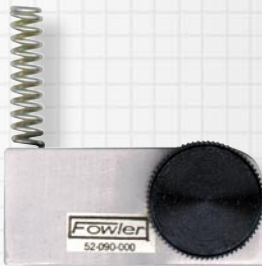
▲ No. 52-090-000 "Snap Gage" Caliper Attachment converts vernier, dial & digital electronic calipers to snap gages—a must for every caliper.