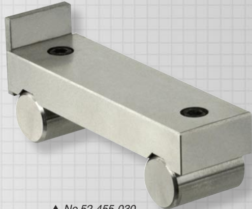
▲ No.52-455-030 (Gage block shown not included.)