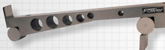
▲ No. 52-455-015 (Gage block shown not included.)