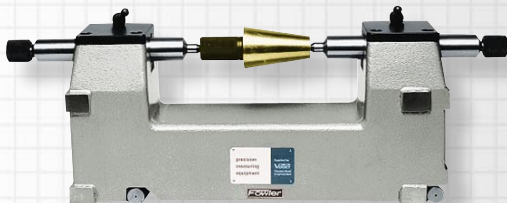
▲ Test Center No. 53-468-005