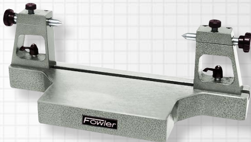
▲ Precision Inspection Center No. 53-468-000