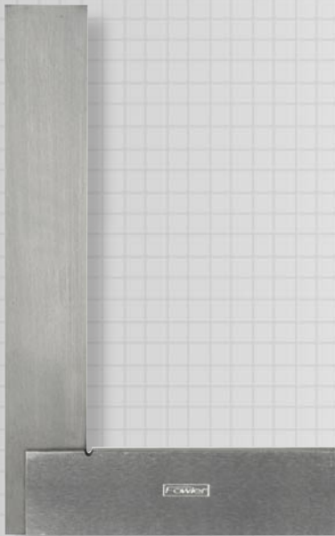
▲ Economy Square No. 52-432-004