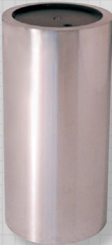
▲ Cylindrical Square No. 52-750-006