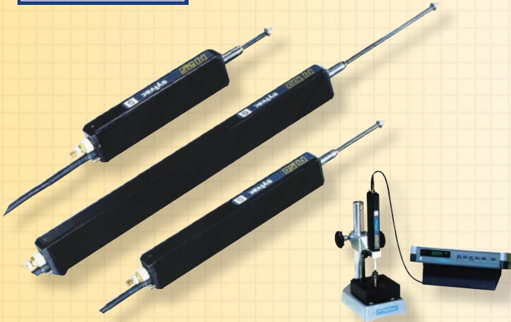
Shown with optional readout