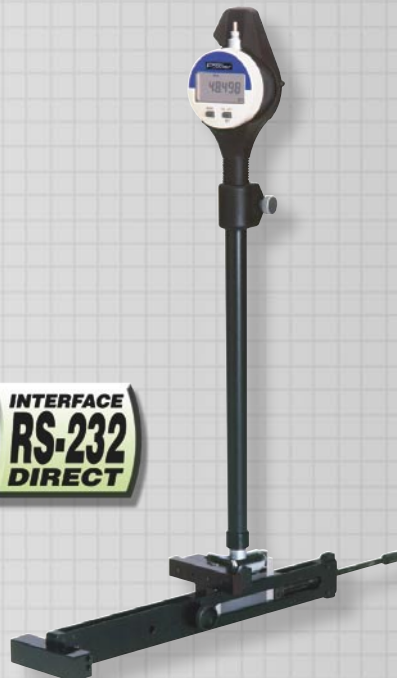
▲ No. 54-549-900 Shown with No. 54-549-906 and Digital Cylinder Bore Gage (not included).