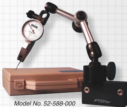
Model No. 52-588-000

Fowler's indicator holder is a unique three-dimensional system with fine adjustment at the base, allowing fast zeroing.