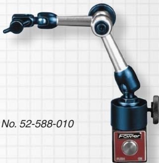
Model No. 52-588-010

Fowler's measuring articulated magnetic bases with central clamping system, on/off switch and fine adjustment