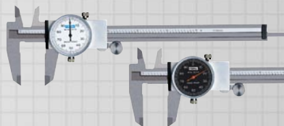
Available with White or Black Face.