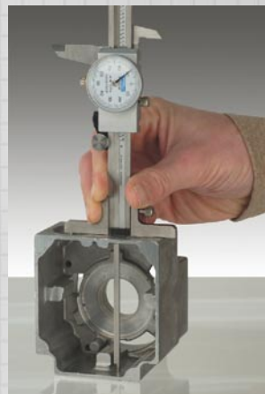
Easy depth measurement!